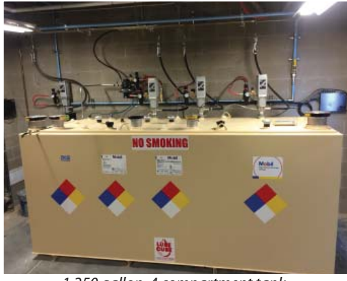
1,250 gallon, 4 compartment tank.