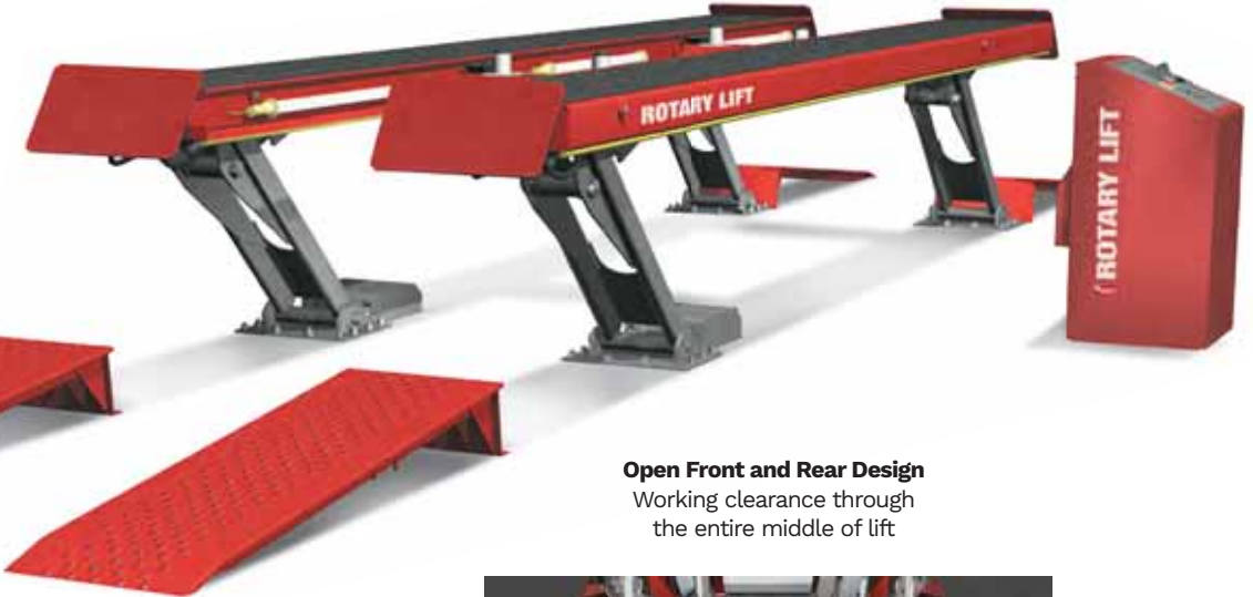
Open Front and Rear Design Working clearance through the entire middle of lift

Automatic wheel chocks engage when the lift is raised, and release when it is lowered.