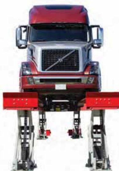
Open Front and Rear Design Working clearance through the entire middle of lift