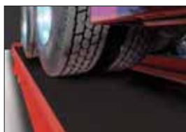
Widest Platform Top Greater drive on area with non-skid platform surface