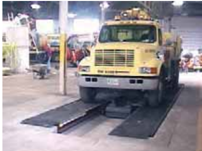
Surface in recessed installation