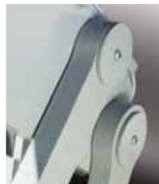
2" and 3" pins provide increased surface area to reduce loading on the pivoting members.

The V-REX lift contains innovative limited sliding components or wear items to inspect or maintain.