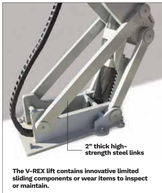
2" thick high-strength steel links

The V-REX linkage transfers lower forces to the foundation, optimizing efficiency. Composite bearings require less maintenance. Legs rotate and pivot rather than slide to increase efficiency and reduce wear. The 2" solid steel leg construction performs better than plate / tube combinations. Installation costs are lower versus other platform styles due to fewer anchors.