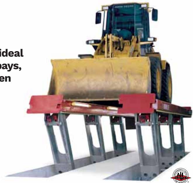
Shown: 50/32-F / 50,000 lbs. capacity flush mount lift

Rotary rigorously cycle tests its lifts and components for thousands of cycles giving you a robust, proven and tested lift that won't let you down. Our parallelogram lifts meet the ANSI/ALI ALCTV 2017 standard.