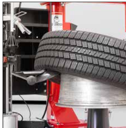
Lower locking disc can demount bottom beads