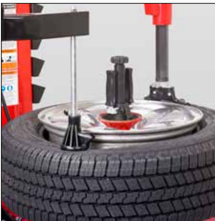
Press arm pushes tire into drop center for mounting and demounting operations