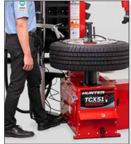
Nozzle is securely mounted to Bead Press carriage, allowing safe, completely hands-free operation.