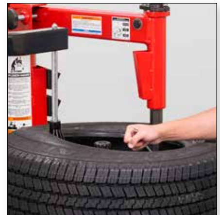
Lifting hook aids the demounting of heavy tires.