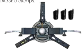
STDA96 3 point wheel clamps Self-centering clamps with quick locking arms and ABS claws. Manual diameter adjustment. Set of 2 clamps.