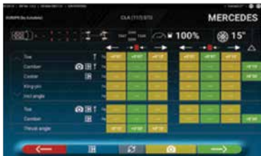
TECHNICAL VEHICLE DATA

- automatically activated to measure sport and tuned car bodies.