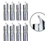
STDA41 extended claws Long metal claws for vans Set of 8 claws / 2.2"