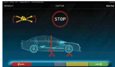
3D RUN OUT INFO