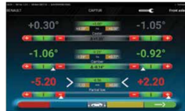
EASY ALIGNMENT DISPLAY