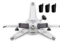
STDA35E 3 point wheel clamps Self-centering clamps with quick locking arms and ABS claws. Set of 2 clamps.

Optional wheel clamps shown are purchased as an option and cannot be substituted for standard STDA33EU clamps.