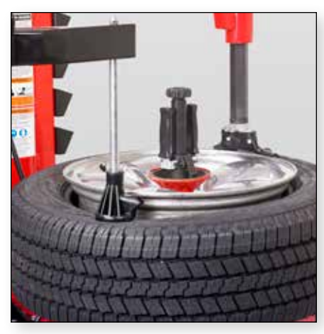
Press arm pushes tire into drop center for mounting and demounting operations

Lower locking disc is great for re-breaking, demounting bottom beads, and lifting heavy tires into the drop center