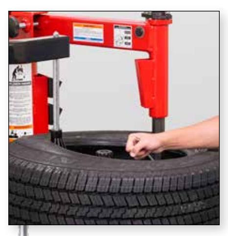
Lifting hook aids the demounting of heavy tires.