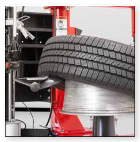
Lower locking disc can demount bottom beads