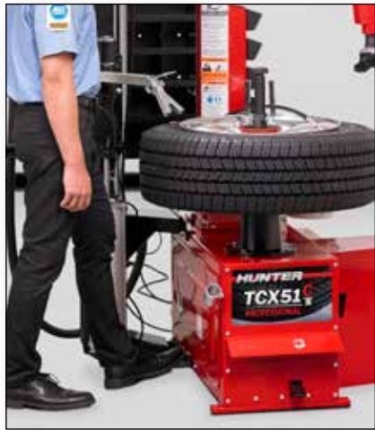
Nozzle is securely mounted to Bead Press carriage, allowing safe, completely hands-free operation.

✓ Large 6.5 gallon air tank features a higher capacity than most portable inflation devices