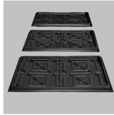
FOUR (4) DRIP TRAYS