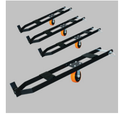
POLY CASTER KIT Includes four casters