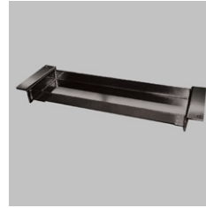
ONE (1) BOTTLE JACK TRAY 4,500 lbs. Capacity